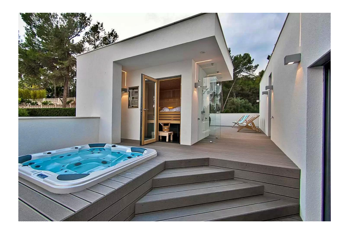
Whirlpool / Sauna